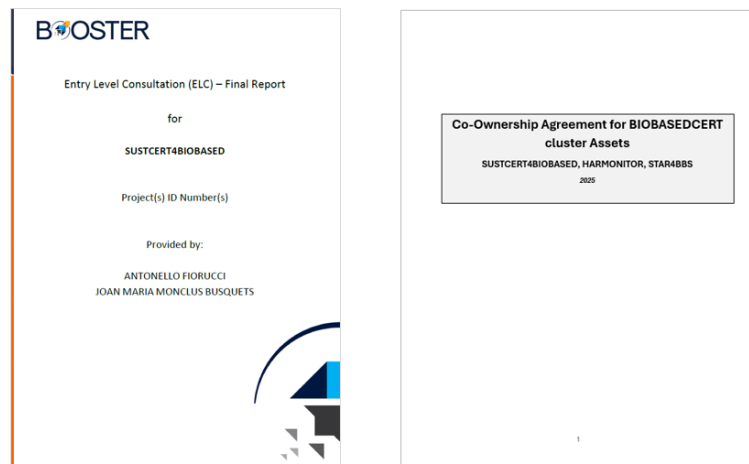
Figure 4. Co-ownership Agreement and Horizon Results Booster

WHITE took the initiative to draft a Co-ownership Agreement that could be used by all three projects. After conducting internal consultations with SUSTCERT4BIOBASED partners, WHITE shared the draft with the BIOBASEDCERT Cluster for further discussion. To gain additional expert guidance, WHITE also applied for Horizon Results Booster Module C and was