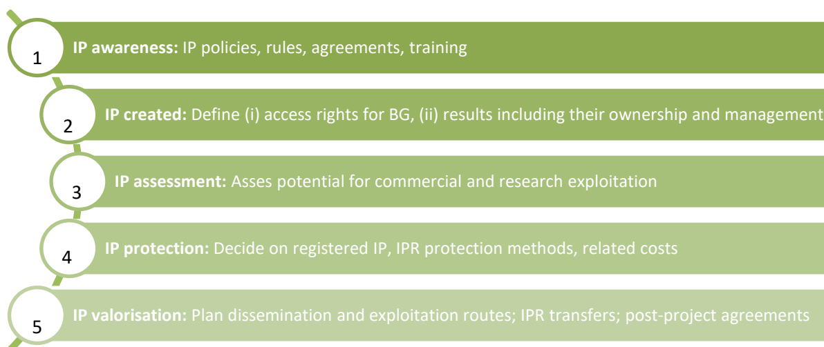
Figure 1. Strategic pillars of IP Management in Horizon Europe research projects

At the strategic level, the Innovation Management approach in SUSTCER4BIOBASED is aligned with the five pillars of IP management in Horizon Europe 1 , with the aim of addressing the diverse IP issues that typically arise at different stages of a collaborative Horizon Europe project.