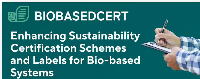
Figure 2. BIOBASEDCERT Cluster

BIOBASEDCERT Cluster is a collaboration between three Horizon Europe projects—SUSTCERT4BIOBASED, STAR4BBS, and HARMONITOR—working to enhance sustainability certification for bio-based systems. The cluster aims to provide a comprehensive overview of existing certification schemes and labels, analyze global trade data to differentiate certified and uncertified bio-based materials, assess the feasibility of selected certification schemes, and promote the adoption of effective sustainability standards among stakeholders. Through joint initiatives, including the development of the BIOBASEDCERT Monitoring Tool (BMT), the cluster contributes to harmonizing certification practices and advancing the sustainability of bio-based value chains.